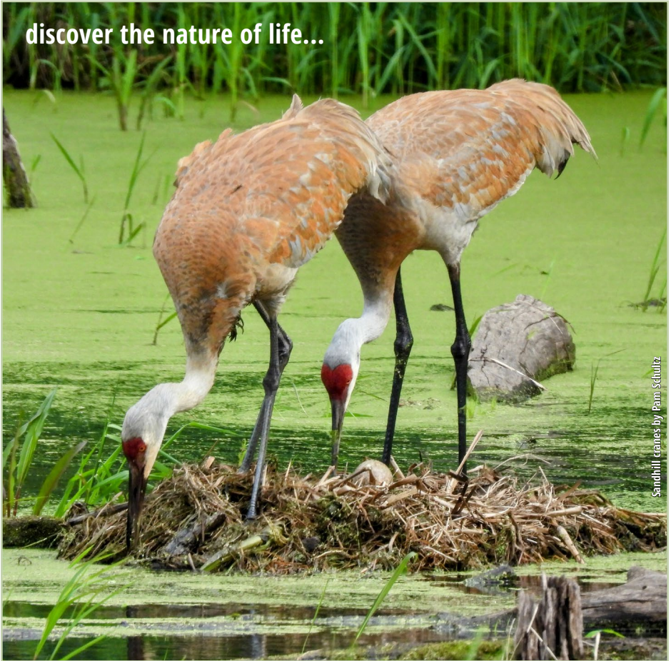
Sandhill cranes

11,639 acres • over 100 miles of hiking trails • 3 campgrounds • 3 golf courses