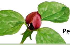
Red Trillium ( Trillium erectum )

For a complete list of programs, visit www.WinnebagoForest.org/Events .