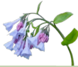
Virginia bluebells ( Mertensia virginica )