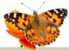
Painted lady butterfly ( Vanessa cardui )