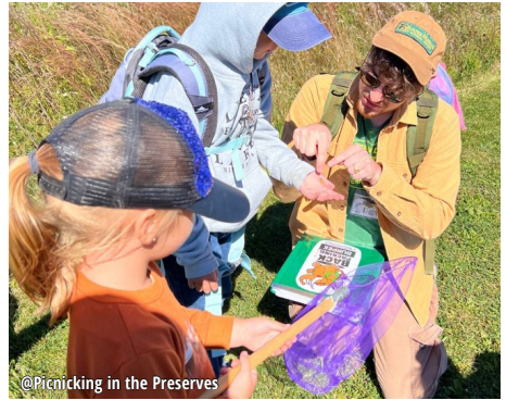
@Picnicking in the Preserves

Birding & Bird Calls - Colored Sands Forest Preserve Saturday, June 7