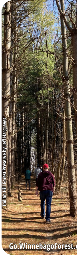
Indian Hill Forest Preserve